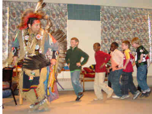
Elementary Students learning native History while Dancing

Our dance lessons will be conducted by highly trained and experienced instructors that will bring as much fun as learning for each and every child.